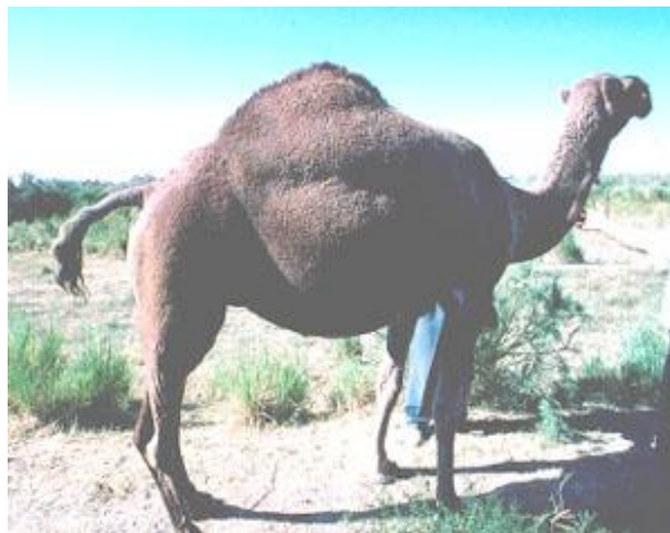
Figure 6 : Arvana breed (Anonyme1)

Turkmenistan, Kazakhstan. Its original cradle is the Karakum Desert in Turkmenistan.