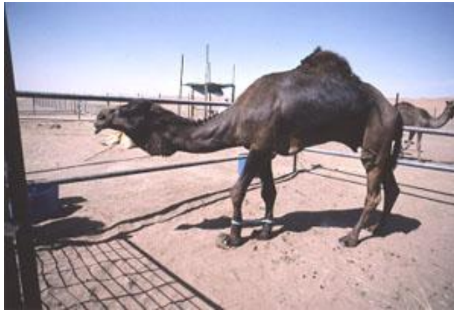
Figure 2 : Almajahim dromedary breed (Anonyme1 )