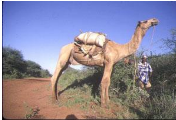
Figure 8 : Somalia breed (Anonyme1)

The female is a good milker ( 1800 L / lactation with maximums reaching up to 2,500 liters ). Somali camel meat is appreciated in Middle Eastern markets.