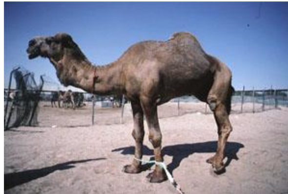
Figure 3: Al-Chaelae breed dromedary (Anonyme 1)

The Al-Chaelae dromedary is quite a good milker and is valued for packing.