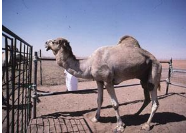
Figure 4: Alkhawar (Anonymel)