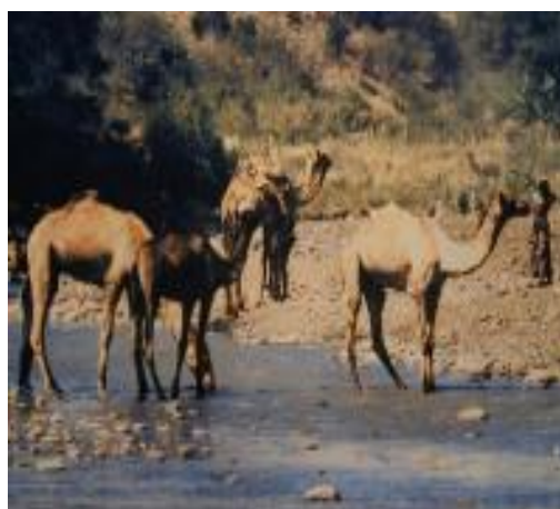
Figure 9 : Dankali dromedary breed (Meyer, 2024 ; Cirad.)

It is mainly used for milk production and as a pack animal. Its milk production is about 1,200 L per 12-month lactation .