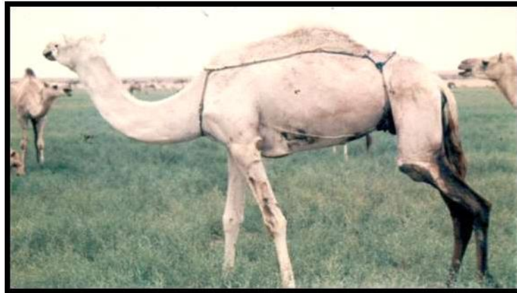
Figure 14 : Ouled sidi Cheikh breed ( Chekima and Keddouda, 2018)