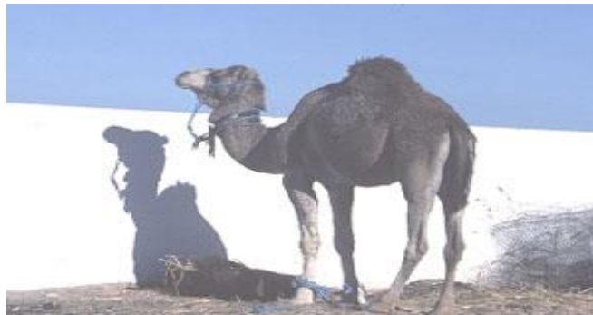
Figure 10 : Châambi dromedary breed (Faye B.)