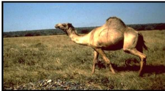
Figure 15 : Berber breed

Animal of fine build, with a muscular hindquarters,