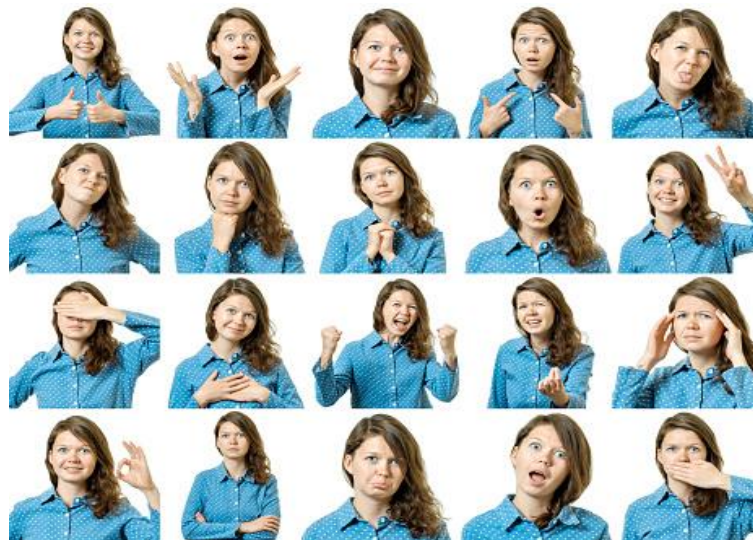
Example: Facial expressions

Nonverbal communication refers to any form of communication that is not transmitted through spoken word. It can include body language, facial expressions, gestures, posture.