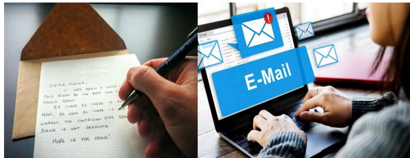
Example: e-mails and letters.

Written communication involves the use of words, sentences, and paragraphs encoded in text in order to communicate.