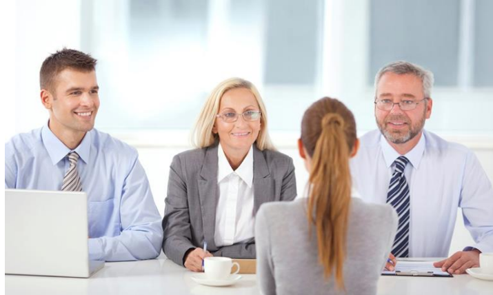
Example: Face-to-Face Job Interviews.

Verbal communication is any form of communication that occurs through spoken word. Its key strength is that it tends to be perceived as a trusted and authentic form of communication generally consist of face-to-face interaction.